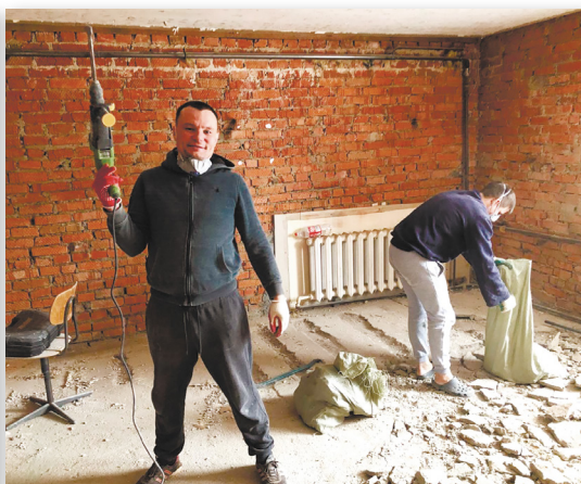
Major repairs on the second floor and stairway of the Rumyantsevo Pirkko Home