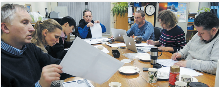
Magazine editorial committee

Understanding the complexity of the situation, we decided to devote the second issue of the magazine this year to the topic of forgiveness. God forgives us when we sincerely repent before Him. We must also forgive each other. The title of this next issue is "As We Forgive Those who Sin Against Us." Please pray for the selection of articles to present this topic clearly, and for all the readers of the magazine.