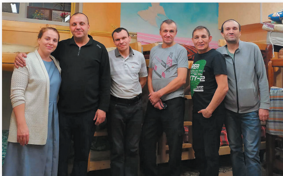
Some send their relatives and friends; others just watch. We are working to preach the Gospel here.

We plan to acquire a house for this ministry within the city limits in the near future. It is the prayer of our hearts and we are actively searching for suitable housing for this ministry.