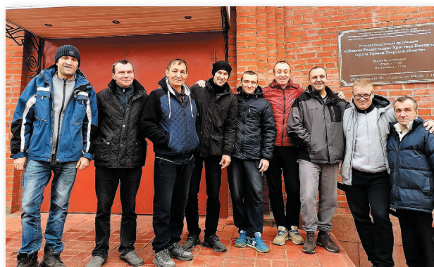
At the Living Word Church, Udomlya

In Russia we have a saying: "Moving is worse than fire!" Of course, it is difficult to move out of a special place that we had prayed over often, and enter a new one. But the local church of Udomlya, with its friendliness and love, like a balm, has soothed and consoled us in these difficult last few months. The brothers here, with special hospitality, allocated some space in their church building for the use of the Pirkko Home ministry. The local brothers and sisters enthusiastically joined in the work of instructing the Pirkko Home residents in the Word of God.