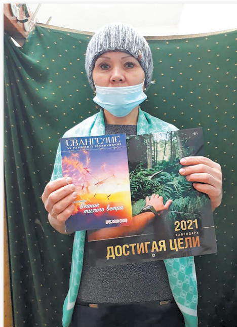
This woman distributes the magazine in the hospital in the Novosibirsk region.

Today we are all going through difficult times. The pandemic has affected all places of detention – many prisons are closed to ministers, but not to the magazine. Our little paper “missionary” hurries to the reader with consolation and spiritual advice; the door is open for him! Through the magazine, the Lord visits all the correctional institutions of the former Soviet Union and Russian-speaking prisoners around the world. Our magazine is received in Ukraine, Belarus, Kazakhstan, Greece, Germany, the USA and other countries.