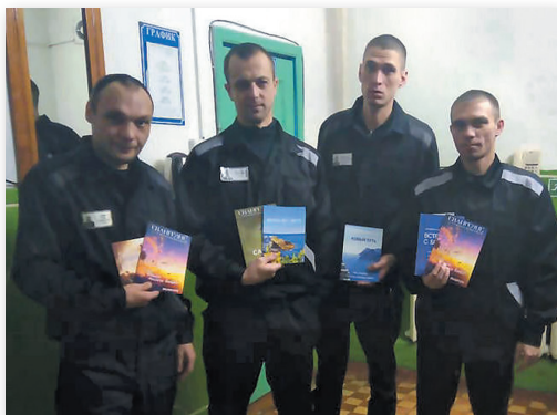
Brothers in the Novosibirsk prison

For more than 25 years Russian Christian Radio has been publishing the magazine The Gospel Behind Barbed Wire – 155 issues so far! Over the years, the magazine has gained a lot of readers both in prisons and at large. People read it in home groups, churches, hospitals, and schools! It is a faithful assistant in the ministry, bringing good news to prisoners, their relatives, and even evangelism to prison officials.