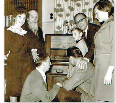
A family listening to the radio.

God gave the gift of a precious son to a young missionary couple serving in the Far East region of Russia 100 years ago. God invested in that young son and grew him into a faithful and effective servant for God’s purposes. And by God’s grace, He will raise up many other precious sons and daughters to carry on the vision of “Millions of Russians for Christ.”