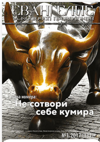
Magazine topic: "No Other Gods"