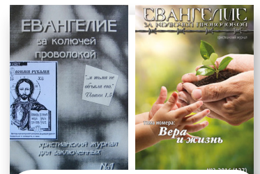
Christian magazine for prisoners - pictured are our very 1st issue and a more recent issue, #127

When national radio was no longer available to us, we found new ways to send out the gospel. We began providing Christian programming via local radio stations, satellite and the internet; we were on the cutting edge of cyber-ministry! In 1995 we were asked to take over the publication of a Christian magazine for prisoners called The Gospel Behind Barbed Wire . Today we continue to publish this magazine and distribute it to about 75% of the 977 prisons in Russia with the help of over 600 Christian volunteers, who initially could visit inmates in the prisons but now mail the magazines and witness to them through correspondence. The radio ministry that also became a prison ministry, became a cyber-ministry and a publishing ministry.