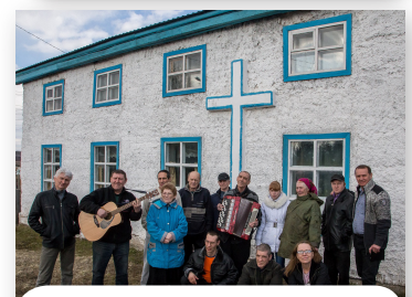
This first Pirkko Home, way up north in Emva, Komi, still ministers to ex-prisoners