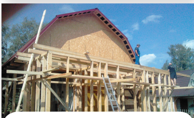
Making progress on a place for the men to live

Plans are still being made for rebuilding a new Pirkko Home on the site where the first one stood. In the meantime, remodeling has begun of another house close by, which was acquired for the minister's family in 2015. This house is being enlarged so it can temporarily be used for the men's rehabilitation center. We are hoping to have this second building enclosed and useable for the men by winter. This is a very important step for us, because men and women should live separately, but until it's ready, they are sharing the same building, the house that was spared by the fire. Usually there are about ten men and ten women in the two Pirkko Homes here. In addition, we continue to get calls about rehabilitation from mothers with children, and we would like to start this program again, as soon as we have the space.