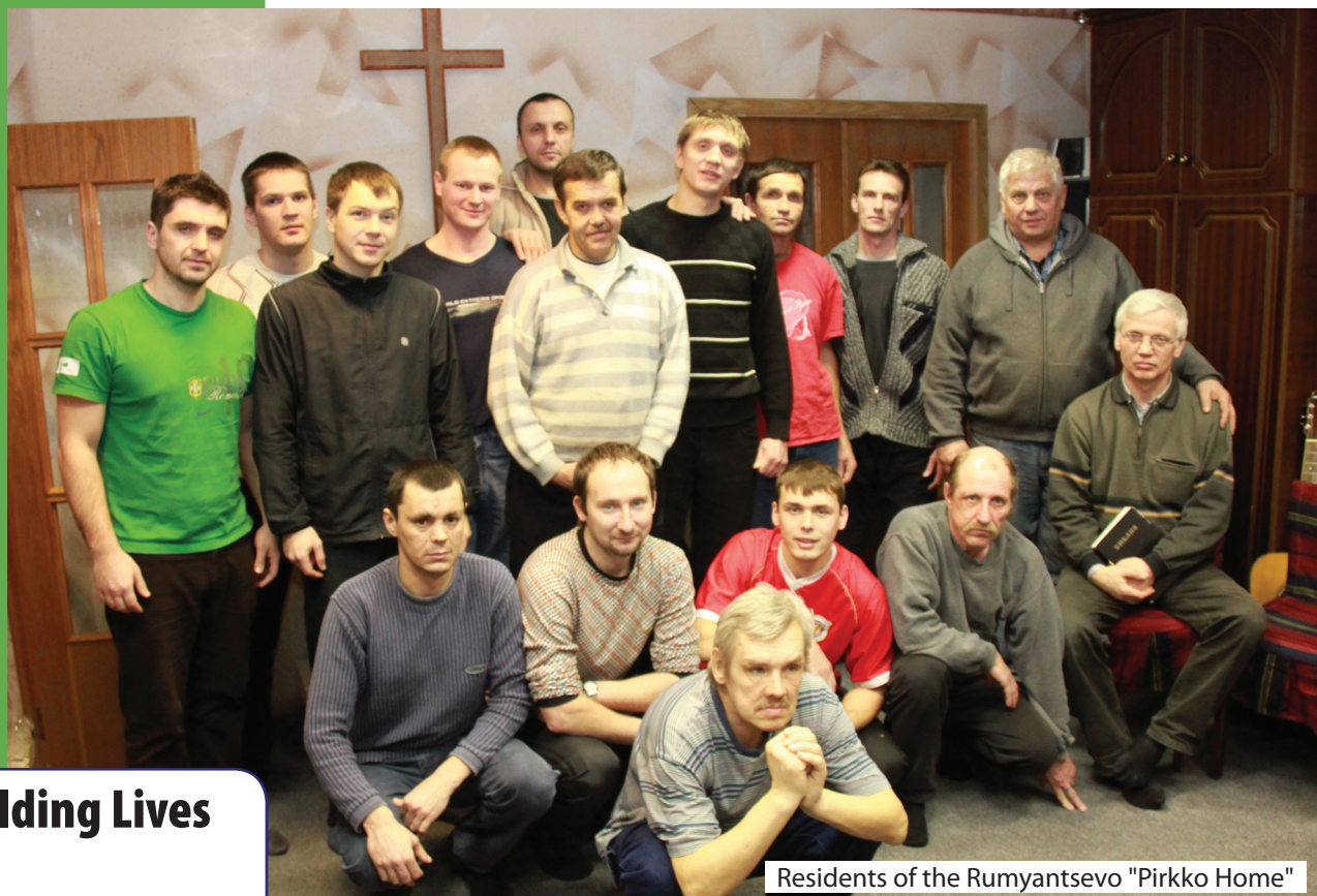
Residents of the Rummyantsevo "Pirkko Home"