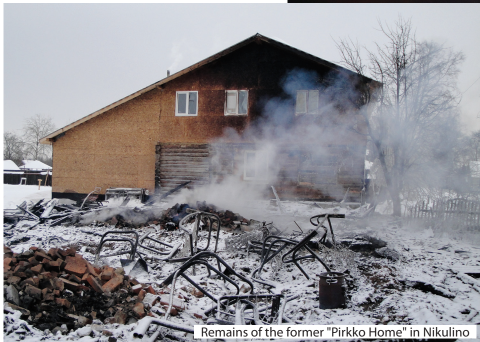
Remains of the former "Pirkko Home" in Nikulino

Plans are already underway to build a new dorm for the men on the same site of the one that burned down. We trust the Lord to supply the funds needed for this project and already our ministry partners have begun to step forward with donations. We estimate the cost for this project to come to $40,000.