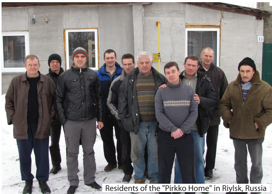
Residents of the "Pirkko Home" in Ryl'sk, Russia