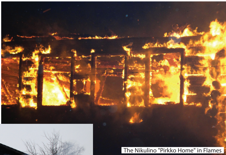
The Nikulino "Pirkko Home" in Flames

On December 18, 2010, the "Pirkko Home" for men in Nikulino, Russia caught fire and was completely destroyed. Fortunately, no one was hurt in the blaze, but all personal items were lost, including bedding, clothing, documents and other things. At the time of the fire, the men had joined the women residents in a Bible study next door in the newly renovated "Pirkko Home" for women. Damage to the women's facility was limited, although several windows in their dorm were impacted by the heat of the fire.