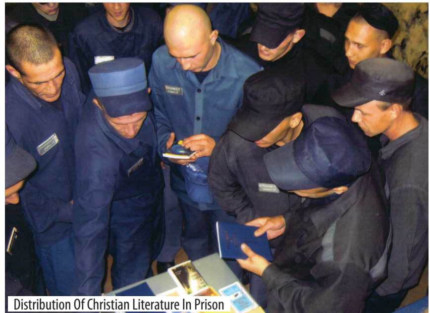
Distribution Of Christian Literature In Prison