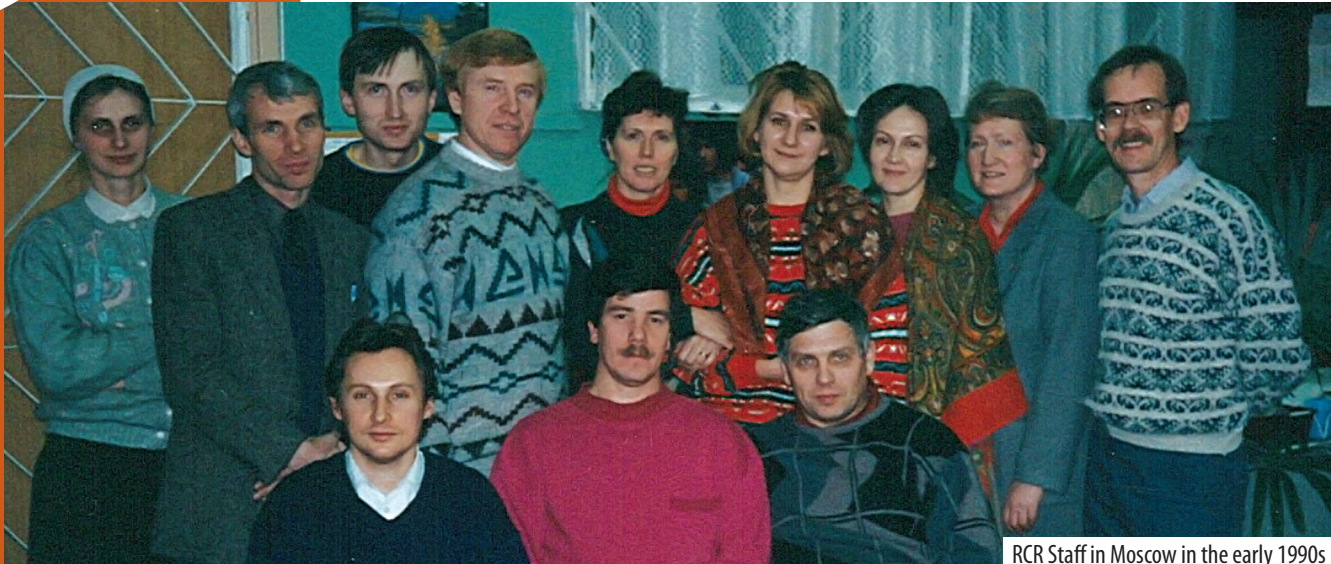
RCR Staff in Moscow in the early 1990s