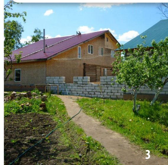
The team from Atlanta, USA helped rebuild the Pirkko Homes in Nikulino in June 2012

In the Kimry Pirkko Home , also in the Tver region, pray that the Lord will bring in new people in need of deliverance and repentance. The construction team from the US and Poland helped remodel some of the Kimry home in June. Praise the Lord for the help which was given to update the home.