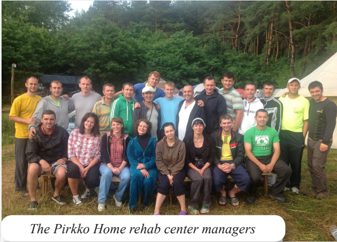
The Pirkko Home rehab center managers

Now, as the men and women in both America and Russia have become more aware of the fact that those leaving our centers often have little choice but to return to the places where sin and Satan first captured them, we have begun praying about what should be done. Many young men and women are ensnared by sin at a young age; often before they have the opportunity to learn a trade that could provide them with a reasonable opportunity to care for themselves and their families. What then should we do? What would the Lord have us to do?