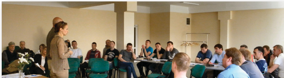
Our meetings with the Pirkko Home leaders and some businessmen were at the Ruchiyok Christian Camp (& adaptation center), outside Moscow

In late April a group of nine team members, representing five churches, went to Russia in order to serve the needs of the Pirkko Home ministry. The goals of this trip were: first, to discuss the possibility of beginning vocational training for the men and women exiting our Pirkko Home rehabilitation centers, and second, to help the leaders of the Pirkko Homes learn leadership techniques.