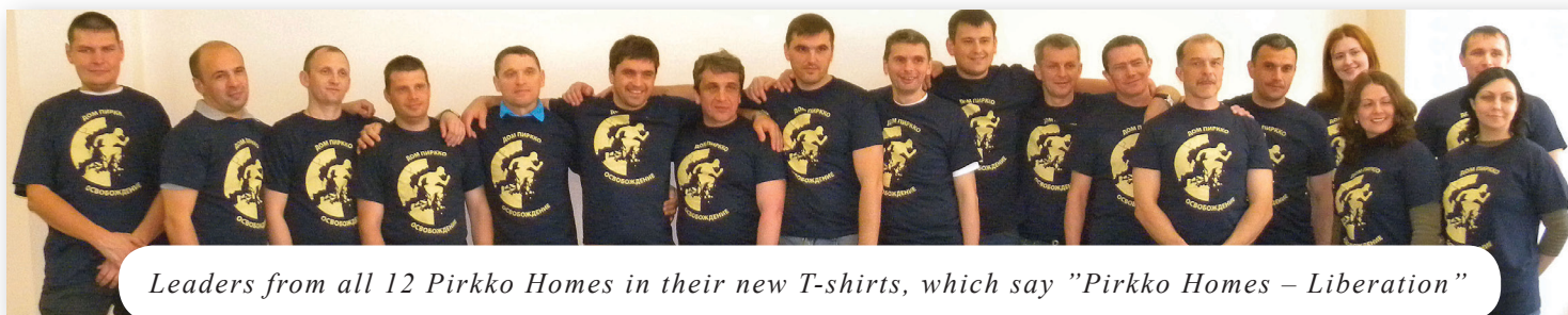
Leaders from all 12 Pirkko Homes in their new T-shirts, which say "Pirkko Homes – Liberation"

Our first goal was clearly established and we hope to start our first job skill training this coming fall with courses in plumbing and carpentry. We are actively looking for churches willing to send trainers and welcome your inquiries about how this can come about.