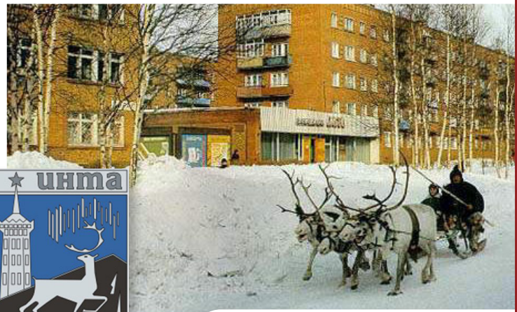
Inta (Инта), in north Russia